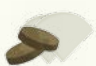
Coffee grounds, filters, tea bags