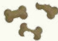
Food for domestic animals