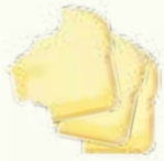
Cereal, grain, bread, pasta, flour and sugar