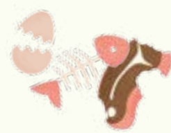
Meat, fish, seafood, egg shells and bones