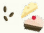
Coffee grounds, filters, tea bags