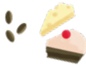
Milk products, pastries, nuts and seeds