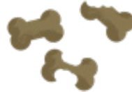
Food for domestic animals