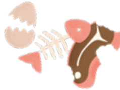
Meat, fish, seafood, egg shells and bones