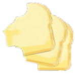
Cereal, grain, bread, pasta, flour and sugar