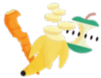
Fruit or vegetables cooked or raw